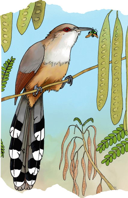
Illustration by Arnaldo Toledo

In this fun game we want you to imagine having this daily routine. It will take some speed and dexterity to help you feed your baby birds.