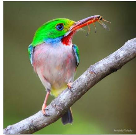
Cuban Tody (Arnaldo Toledo)

Cuba is well-known for its amazing landscapes, vibrant culture and unique biodiversity. According to the Annotated Checklist of the Birds of Cuba 2023 (and recent research), 404 birds have been recorded in Cuba, including 28 which are endemic to the island and 21 which are considered globally threatened. Due to its large land area and geographical position within the Caribbean, Cuba is also extraordinarily important for Neotropical migratory birds—more than 180 species pass through during migration or spend the winter on the island.