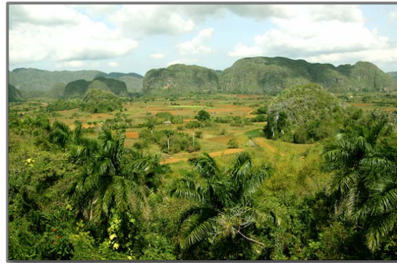
Viñales Valley with mogotes (Carrol Henderson)

Day 2 (Viñales): Morning birding nearby in Viñales National Park/Parque de Viñales in pursuit of Cuban Solitaire , Cuban Tody , Cuban Trogon , Red-legged Honeycreeper , Western Spindalis , Great Lizard Cuckoo , Cuban Blackbird , Yellow-headed Warbler , as well as some migrant species like warblers, tanagers, and buntings. During the afternoon, visit to Benito’s Tobacco Farm , birding in pine forest near El Albino Reservoir to search for the Olive-capped Warbler and Yellow-headed Warbler , San Vicente Farm to look for the Scaly-naped Pigeon , and visit at the home of Nils Navarro , renowned Cuban wildlife artist and naturalist and author of newly-published Endemic Birds of Cuba: A Comprehensive Field Guide .