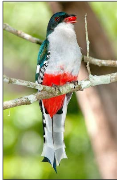
Cuban Trogon

Other species of interest (including regional endemics and Caribbean specialties) include: West Indian Whistling-Duck, White-cheeked Pintail, Great Great Lizard-Cuckoo, Cuban Parrot, West-Indian Woodpecker, La Sagra's Flycatcher, Cuban Pewee, Giant Kingbird, Loggerhead Kingbird, Cuban Crow, Red-legged Thrush, Bahama Mockingbird, Olive-capped Warbler, Western Spindalis, Key West Quail-Dove, Ruddy Quail-Dove, Zenaida Dove, Plain Pigeon, Stygian Owl, American Kestrel (Cuban race), Antillean Palm Swift, Thick-billed Vireo, Cuban Emerald, Greater Antillean Grackle, Tawny-shouldered Blackbird, Eastern Meadowlark (Cuban race), American Flamingo, Wood Stork, Roseate Spoonbill, a great variety of waterbirds, and numerous other migratory and resident species.