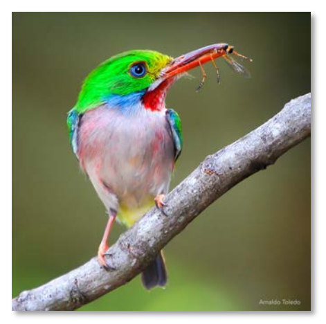
Cuban Tody (Arnaldo Toledo)

well as many migrants. Along the way, we will meet Cuban ornithologists and guides, people in local communities, stay in Bed & Breakfast establishments ( casas particulares ) and eat in private restaurants ( paladars ), allowing you to experience Cuba's rich culture, delicious food, friendly people, and generous hospitality.