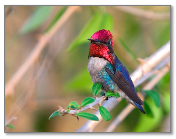
Bee Hummingbird, Cuba's most adorable bird and smallest bird in the world.

departure to Havana with a stop at Finca Vigía (Lookout Farm) to tour Ernest Hemingway's home, located in the town of San Francisco de Paula, 10 miles east of Havana. Hemingway purchased the property in 1940 and lived there for 20 years. This is where he wrote his celebrated novels: The Old Man and the Sea and For Whom the Bell Tolls . The beautiful house and property, restored by the Cuban government, is now a museum, with Hemingway's furniture, books, paintings, animal trophies, and other collectibles from his travels around the world on display.