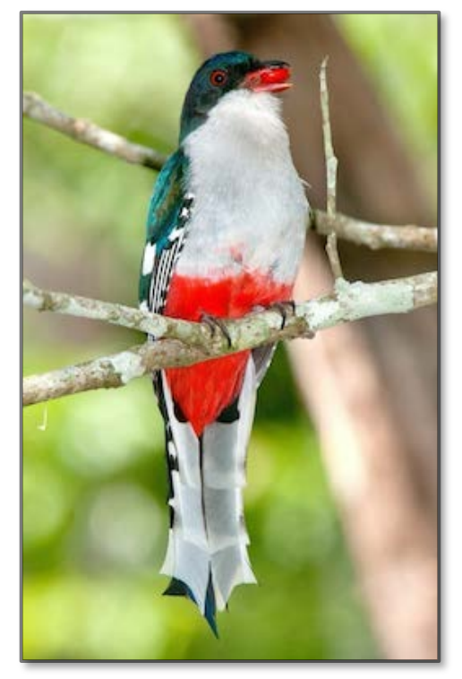
Cuban Trogon (Nils Navarro)

Possible Cuban endemic birds to see on this trip include: Cuban Black-Hawk, Gundlach's Hawk, Blueheaded Quail-Dove, Gray-fronted Quail-Dove, Barelegged Owl, Cuban Pygmy-Owl, Bee Hummingbird, Cuban Trogon, Cuban Tody, Cuban Green Woodpecker, Fernandina's Flicker, Cuban Parakeet, Cuban Vireo, Zapata Wren, Cuban Solitaire, Yellowheaded Warbler, Cuban Grassquit, Zapata Sparrow, Red-shouldered Blackbird, Cuban Blackbird, Cuban Oriole, Cuban Bullfinch, Cuban Nightjar.