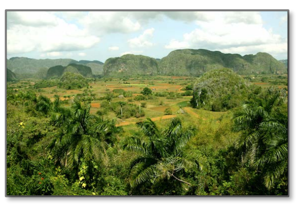
Viñales Valley with mogotes (Carrol Henderson)

Day 2 (Viñales): Morning birding nearby in Viñales National Park/Parque de Viñales in pursuit of Cuban Solitaire, Cuban Tody, Cuban Trogon, Red-legged Honeycreeper, Western Spindalis, Great Lizard Cuckoo, Cuban Blackbird, Yellow-headed Warbler, as well as some migrant species like warblers, tanagers, and buntings. During the afternoon, visit to Benito's Tobacco Farm, birding in pine forest near El Albino Reservoir to search for the Olive-capped Warbler and Yellow-headed Warbler, San