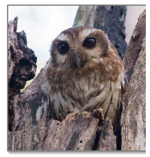
Bare-legged Owl in Bermejas, Zapata Swamp

Once you have registered to go on the trip you will receive more information, including what to bring, what to wear, bird checklist, and travel in Cuba, which is an inimitable experience and part of the fun!