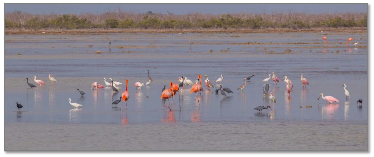
Waterbirds feeding at Las Salinas, Zapata Swamp (Garry Donaldson)