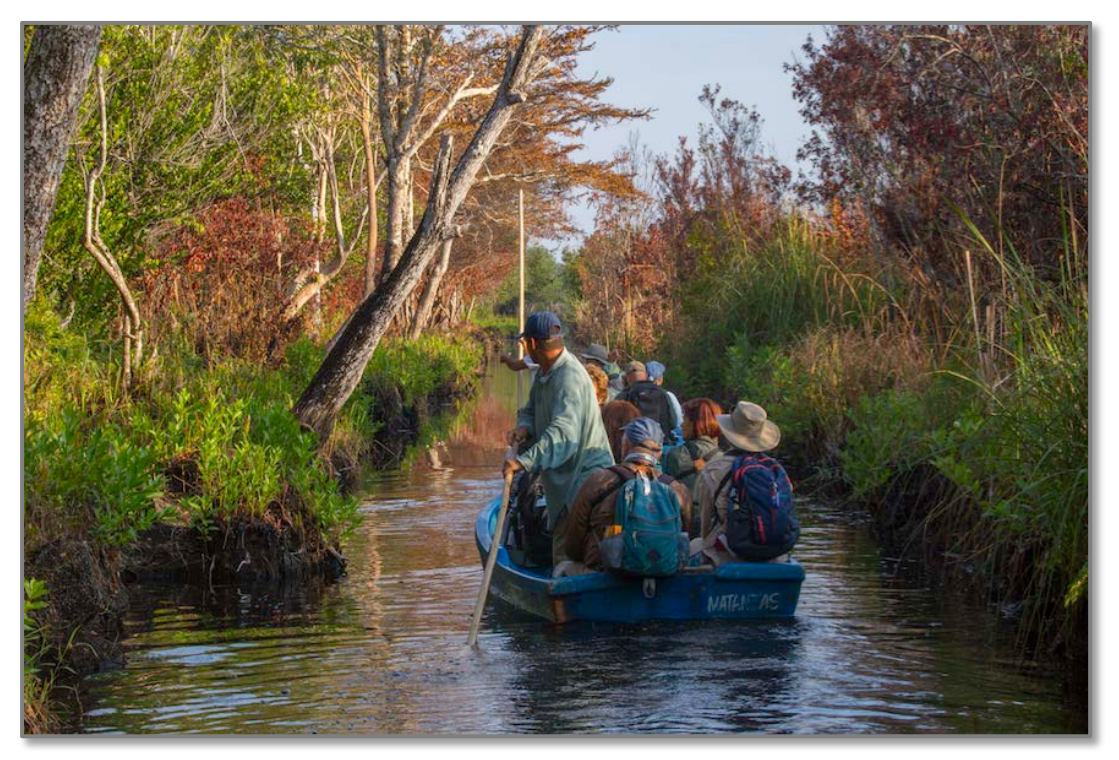
Boat ride in search of the Zapata Sparrow and Zapata Wren Santo Tomas, Zapata Swamp (Garry Donaldson)