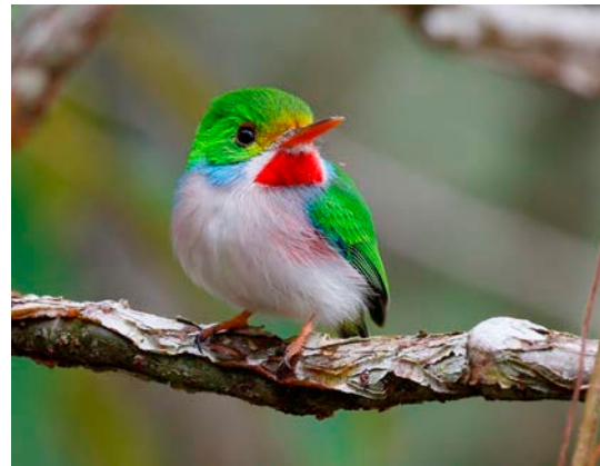
Cuban Tody by Bill Hebner

Cuba is well-known for its amazing landscapes, vibrant culture and unique biodiversity. According to the new Endemic Birds of Cuba: A Comprehensive Field Guide , over 371 birds have been recorded in Cuba, including 26 which are endemic to the island and 30 which are considered globally threatened. Due to its large land area and geographical position within the Caribbean, Cuba is also extraordinarily important for Neotropical migratory birds—more than 180 species pass through during migration or spend the winter on the island.