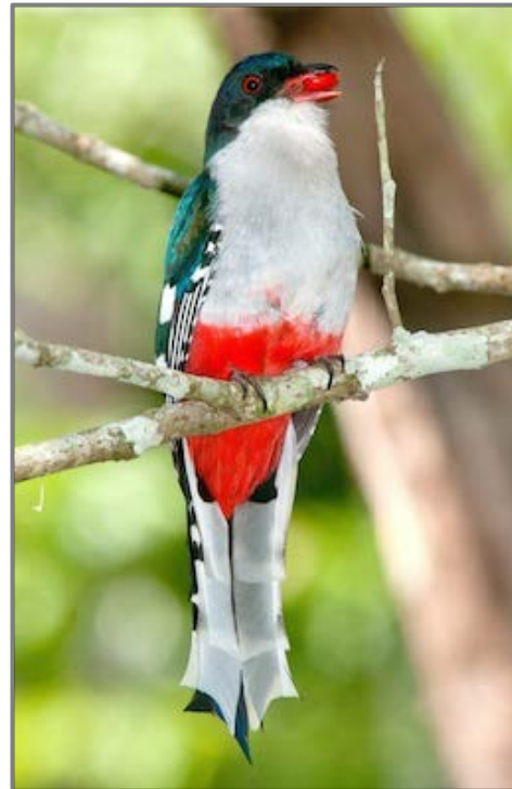
Cuban Trogon by Nils Navarro

Possible Cuban endemic birds to see on this trip include: Cuban Black-Hawk, Gundlach’s Hawk, Blue-headed Quail-Dove, Gray-fronted Quail-Dove, Bare-legged Owl, Cuban Pygmy-Owl, Bee Hummingbird, Cuban Trogon, Cuban Tody, Cuban Green Woodpecker, Fernandina’s Flicker, Cuban Parakeet, Cuban Vireo, Zapata Wren, Cuban Solitaire, Yellow-headed Warbler, Cuban Grassquit, Zapata Sparrow, Red-shouldered Blackbird, Cuban Blackbird, Cuban Oriole.