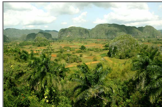
Viñales Valley with mogotes by Carrol Henderson

Day 4 (Zapata: La Cuchilla, Caminos los Jarros, Bermejas, Cueva de los Peces, and Los Hondones): Early breakfast and departure for Bermejas (45 minutes) for birding in mixed forest habitat (flat, easy-walking trail system 2+ miles). Excellent chance for Bee Hummingbird , Gray-fronted Quail-Dove , Key West Quail-Dove , Ruddy Quail-Dove , Cuban Parrot , Cuban Blackbird , Cuban Bullfinch , Loggerhead Kingbird , Bare-legged Owl and Cuban Pygmy Owl . The threatened Cuban Parakeet , Fernandina's Flicker , and Blue-headed Quail-Dove are also likely.