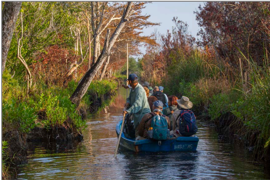
Boat ride in search of the Zapata Sparrow and Zapata Wren Santo Tomas, Zapata Swamp (by Garry Donaldson)