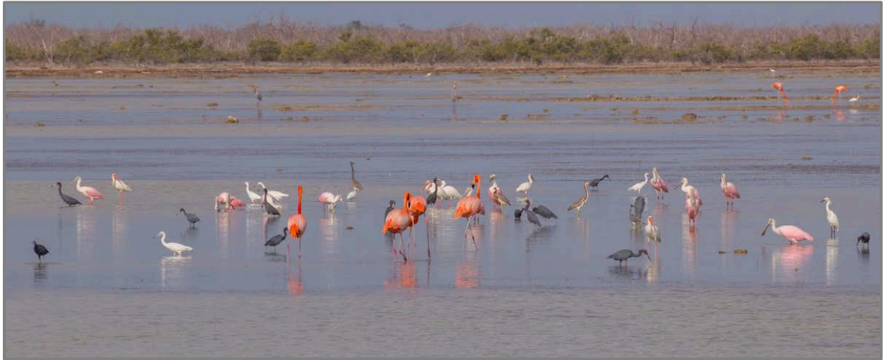
Waterbirds feeding at Las Salinas, Zapata Swamp