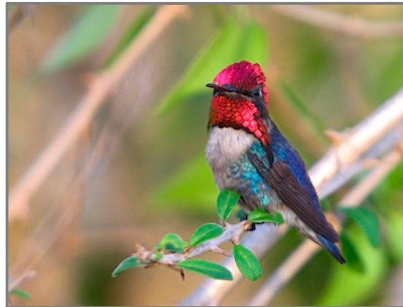
Bee Hummingbird, Cuba's most adorable bird and smallest bird in the world.

Day 6 (Zapata to Havana): Morning departure to Havana with a stop at Finca Vigía (Lookout Farm) to tour Ernest Hemingway's home, located in the town of San Francisco de Paula, 10 miles east of Havana. Hemingway purchased the property in 1940 and lived there for 20 years. This is where he wrote his celebrated novels: The Old Man and the Sea and For Whom the Bell Tolls . The beautiful house and property, restored by the Cuban government, is now a museum, with Hemingway's furniture, books, paintings, animal trophies, and other collectibles from his travels around the world on display. The house is listed as one of the 11 Most Endangered Places by the National Trust for Historic Preservation and on the World Monuments Fund's list of 100 Most Endangered sites. Visiting Finca Vigía is a must for Hemmingway fans and great for non-fans as well as it also offers excellent birding on the property!