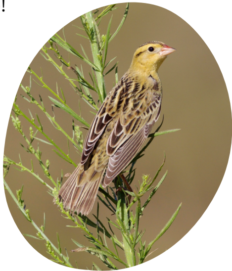
Male Bobolink in non-breeding plumage.

On the next page, see if you can draw a map, from memory, of a path you are familiar with. This can be from home to a park or from your bedroom to the front door. Try to include as many details as you can. Recognizable sounds and smells can even be part of your too!