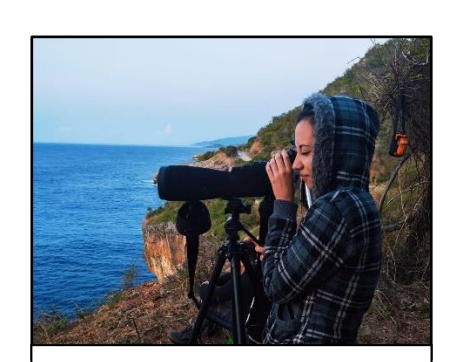
Visual and auditory surveys were conducted on the southeast coast of Cuba in January 22.

At the 12-hour counting points along the coast, 28 petrels were located visually in a group that was making zig-zag flights very close to the sea. No petrels were visually detected at the 12-hour counting point up the mountain, but vocalizations were detected. Two of the ten points with short listening sessions had vocalizations (those closest to La Bruja). Overall, 656 auditory detections were made over approximately 72 hours of sampling, with 99.5% being identified as groups. Contact Carmen Plasencia.