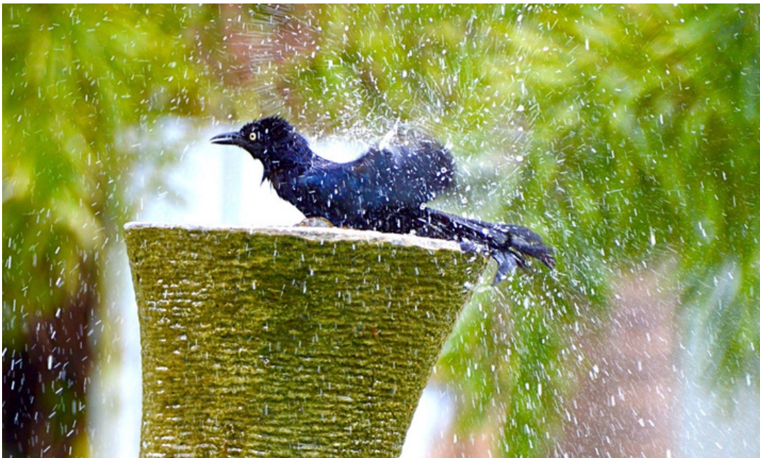
Greater Antillean Grackle enjoying a bath (Jamaica).

You can make your own birdbath using materials from around your house and yard.