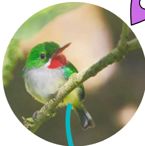
Puerto Rican Tody