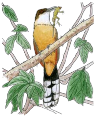
33 Jamaican Lizard-Cuckoo