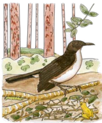
34 White-breasted Thrasher