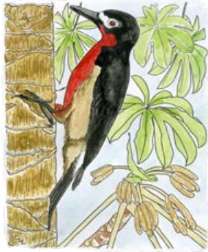
37 Puerto Rican Woodpecker