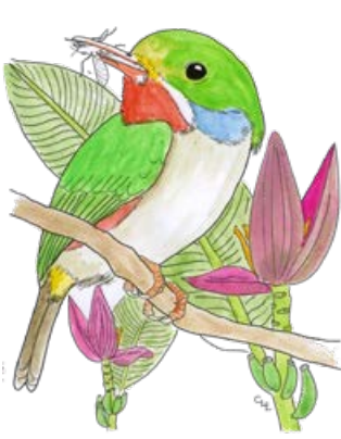
17 Cuban Tody