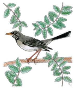
41 Red-legged Thrush