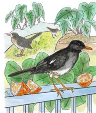
44 White-chinned Thrush