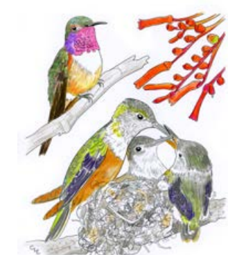
8 Bahama Woodstar