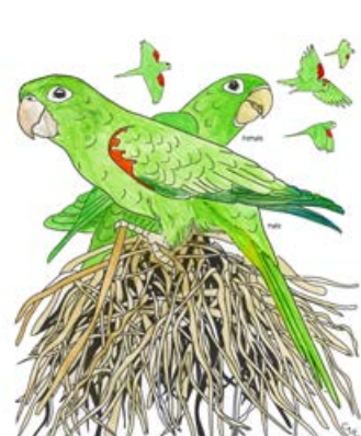
11 Hispaniolan Parakeet