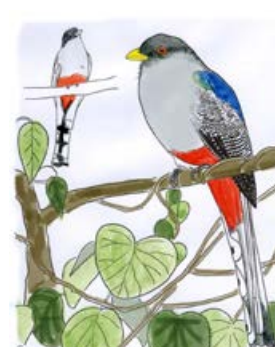
49 Hispaniolan Trogon