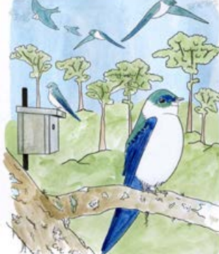
23 Golden Swallow