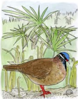
46 Blue-headed Quail-Dove