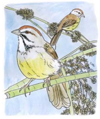
20 Zapata Sparrow