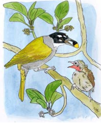
18 Black-crowned Palm-Tanager