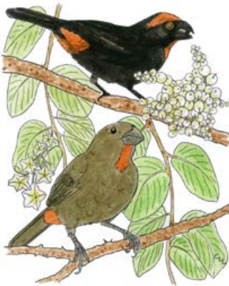
42 Puerto Rican Bullfinch