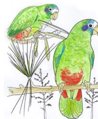
15 Hispaniolan Parrot