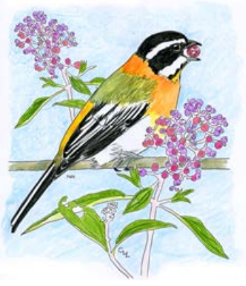
27 Western Spindalis