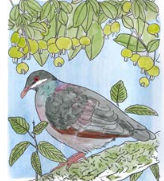
22 Bridled Quail-Dove