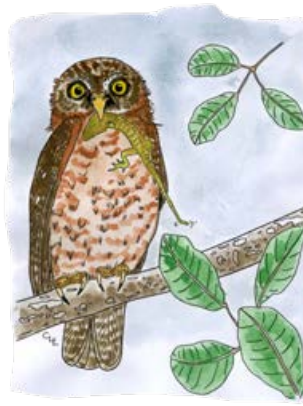
35 Cuban Pygmy-Owl