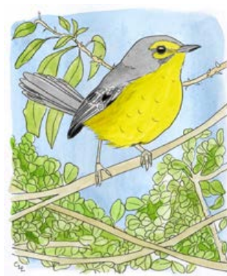
4 Barbuda Warbler