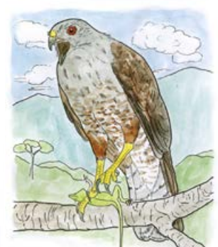
50 Ridgway's Hawk