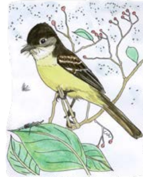
40 Sad Flycatcher