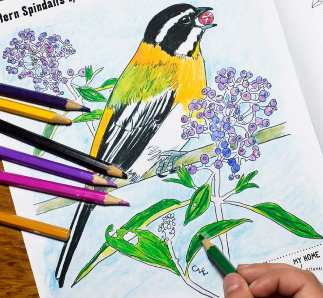
Western Spindalis Spindalis zana