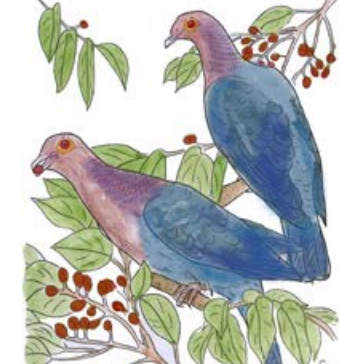
24 Scaly-naped Pigeon