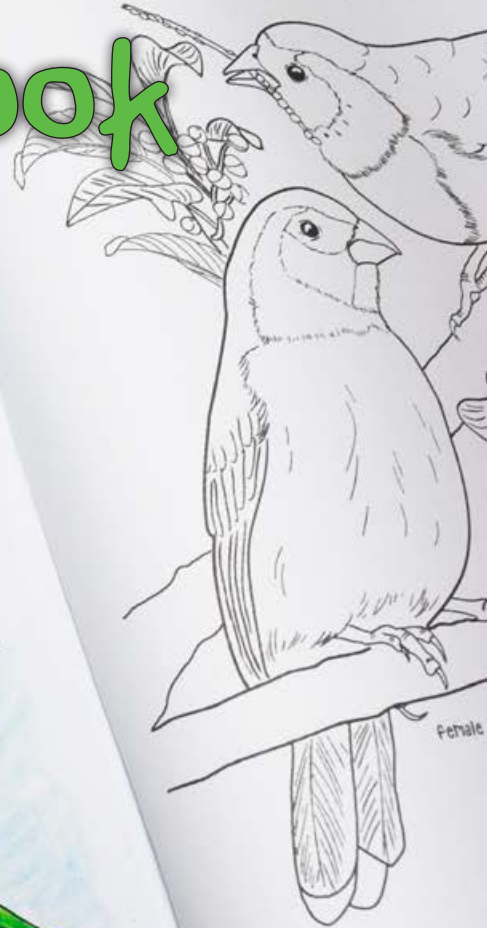
Cuban Grassquit Tiaris canorus

Colouring tips 50 birds to colour Interesting facts