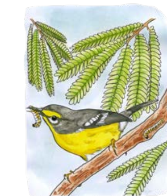
9 Adelaide's Warbler