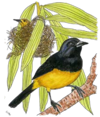
45 Montserrat Oriole