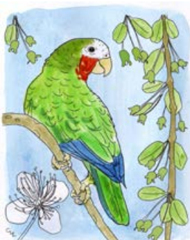
47 Cuban Parrot