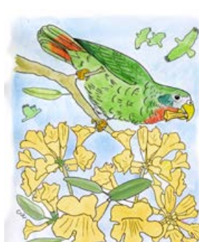
48 Yellow-billed Parrot