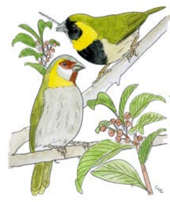
28 Cuban Grassquit