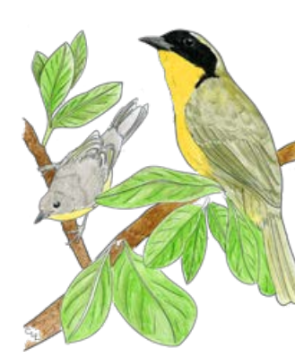
12 Bahama Yellowthroat