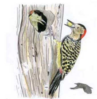
5 Hispaniolan Woodpecker