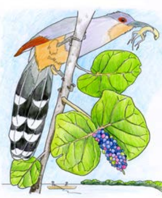
30 Hispaniolan Lizard-Cuckoo