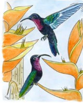
39 Purple-throated Carib