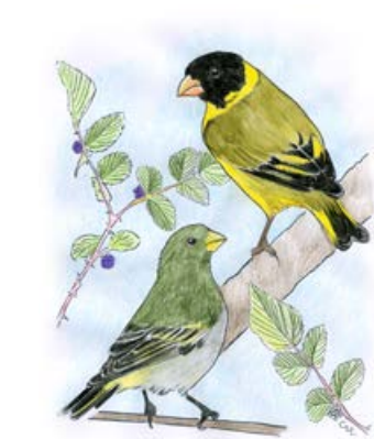
13 Antillean Siskin