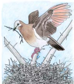
6 Grenada Dove