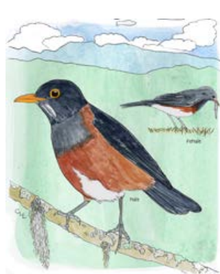
10 La Selle Thrush