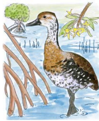
19 West Indian Whistling-Duck