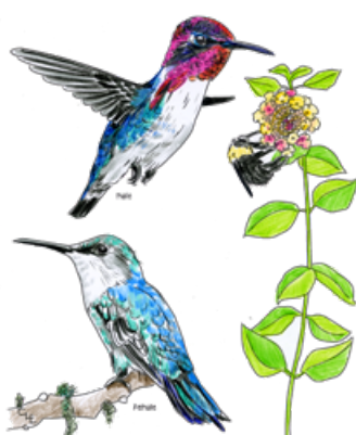
2 Bee Hummingbird