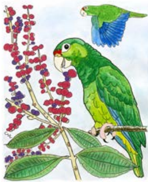
38 Puerto Rican Parrot