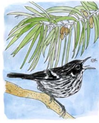
31 Elfyn Woods Warbler