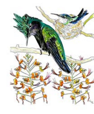
16 Antillean Crested Hummingbird