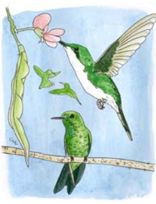
14 Puerto Rican Emerald