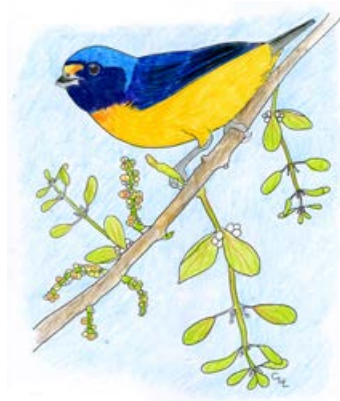
1 Antillean Euphonia

use these pictures to help you with your colouring