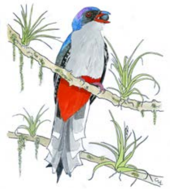
36 Cuban Trogon