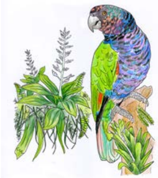
21 Imperial Parrot