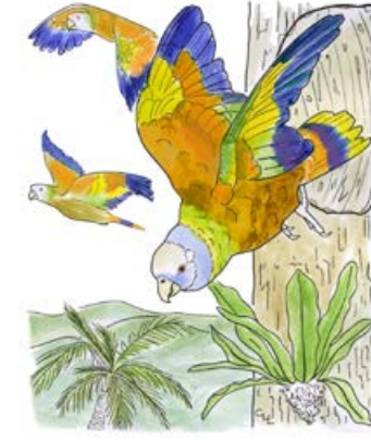
26 St. Vincent Parrot