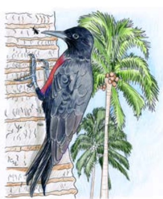
3 Guadeloupe Woodpecker