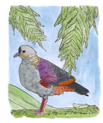
32 Crested Quail-Dove