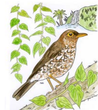
7 Forest Thrush