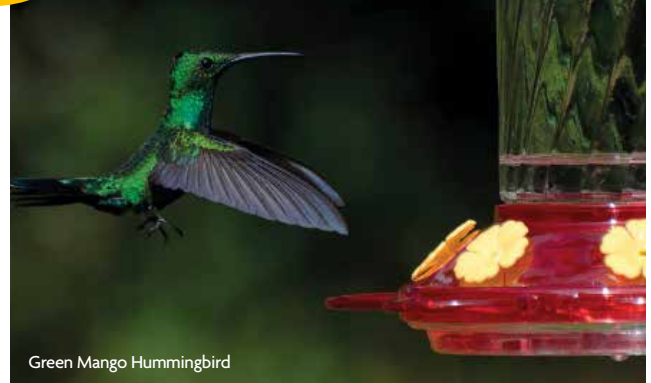
Green Mango Hummingbird