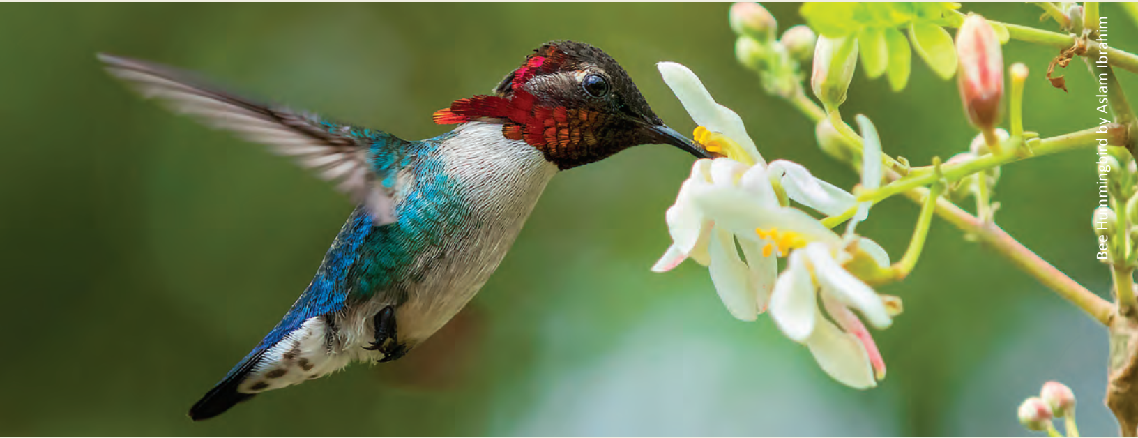
Bee Hummingbird by Aslam Ibrahim

The Caribbean Birding Trail is a network of the best sites on each island for birdwatching , enjoying nature and experiencing culture .