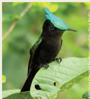
Antillean Crested Hummingbird