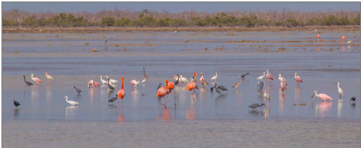
Waterbirds feeding at Las Salinas, Zapata Swamp