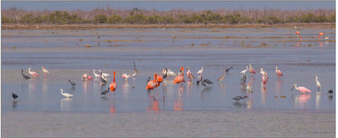
Waterbirds feeding at Las Salinas, Zapata Swamp (by Garry Donaldson)