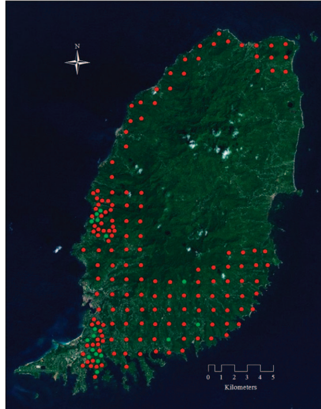
FIGURE 2. Map of the island of Grenada (area \sim 34,400 ha; 12.00^\circ\text{N} , 61.78^\circ\text{W} ), showing the survey region, which covered 7,621 ha. Green circles are for survey points where Grenada Doves were detected during July 19–31, 2013.

A 6-min count increased the chance of detecting calling doves visually, facilitating distance measurements with rangefinders. However, when calling doves were not seen, we measured distances to the nearest horizontal locations and used distance categories (0–15, 16–30, 31–45, 46–60, 61–90, 91–120, 121–180, 181–240, 241–340, and 341–440 m; Rivera-Milán et al. 2003b, 2014). Moving doves were not