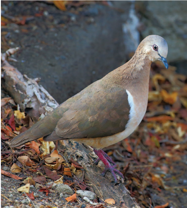
FIGURE 1. When a Grenada Dove is flushed from a perch by an approaching observer, it will fly a short distance to another perch or to the ground and walk slowly away to find cover. Grenada Doves can also be seen singly or in small clusters drinking water and foraging on the ground in forested areas.

and k is the number of survey points. We truncated the distance data ( w = 340 m) and estimated detection probability as