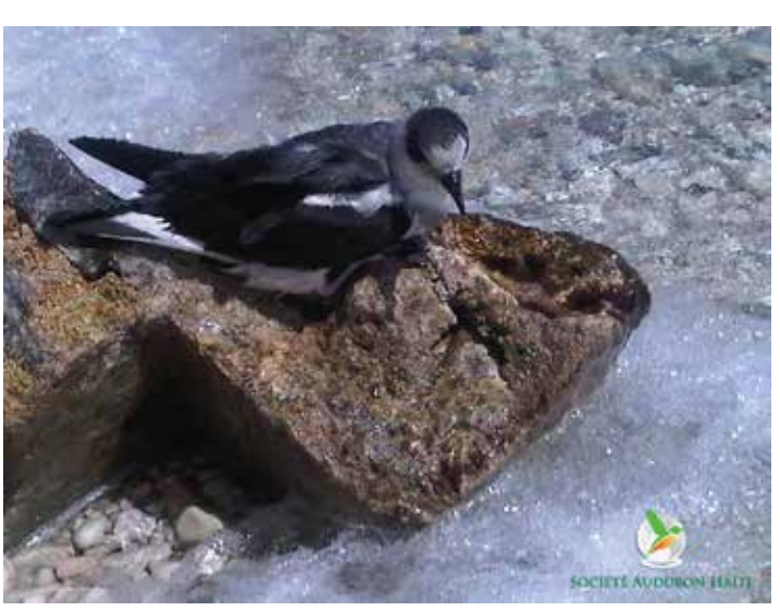
"Nature's tower to Gaston: Cleared for take off!"