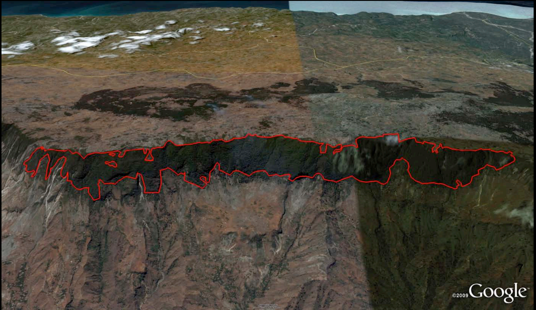
Largest broadleaf forest: 7km long, <400m wide, 230 hectares