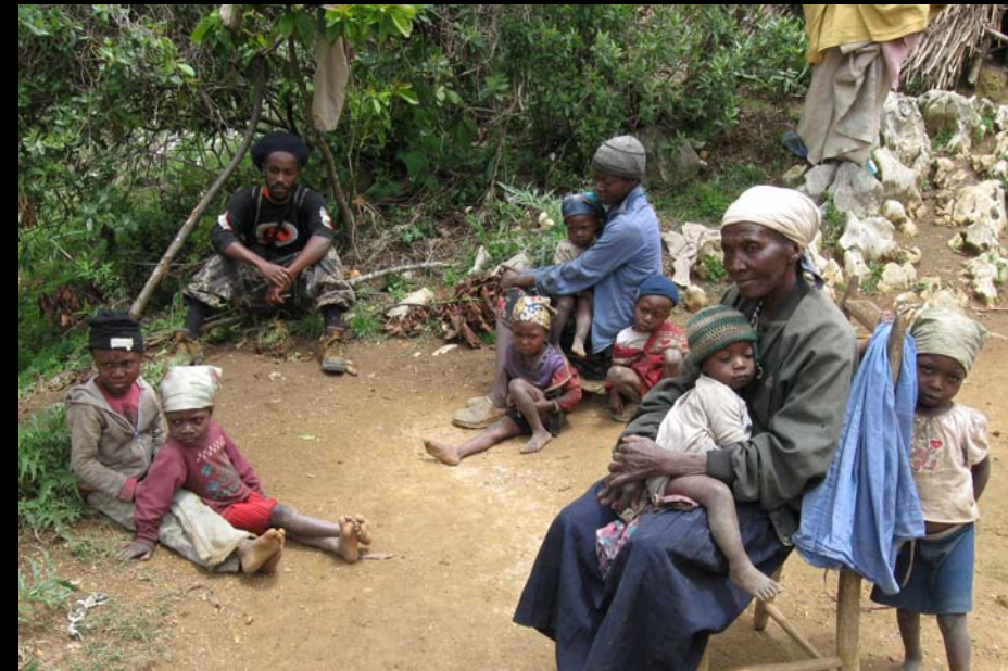
2009 La Visite Expedition. Interviews & focus groups to understand local issues & resource use