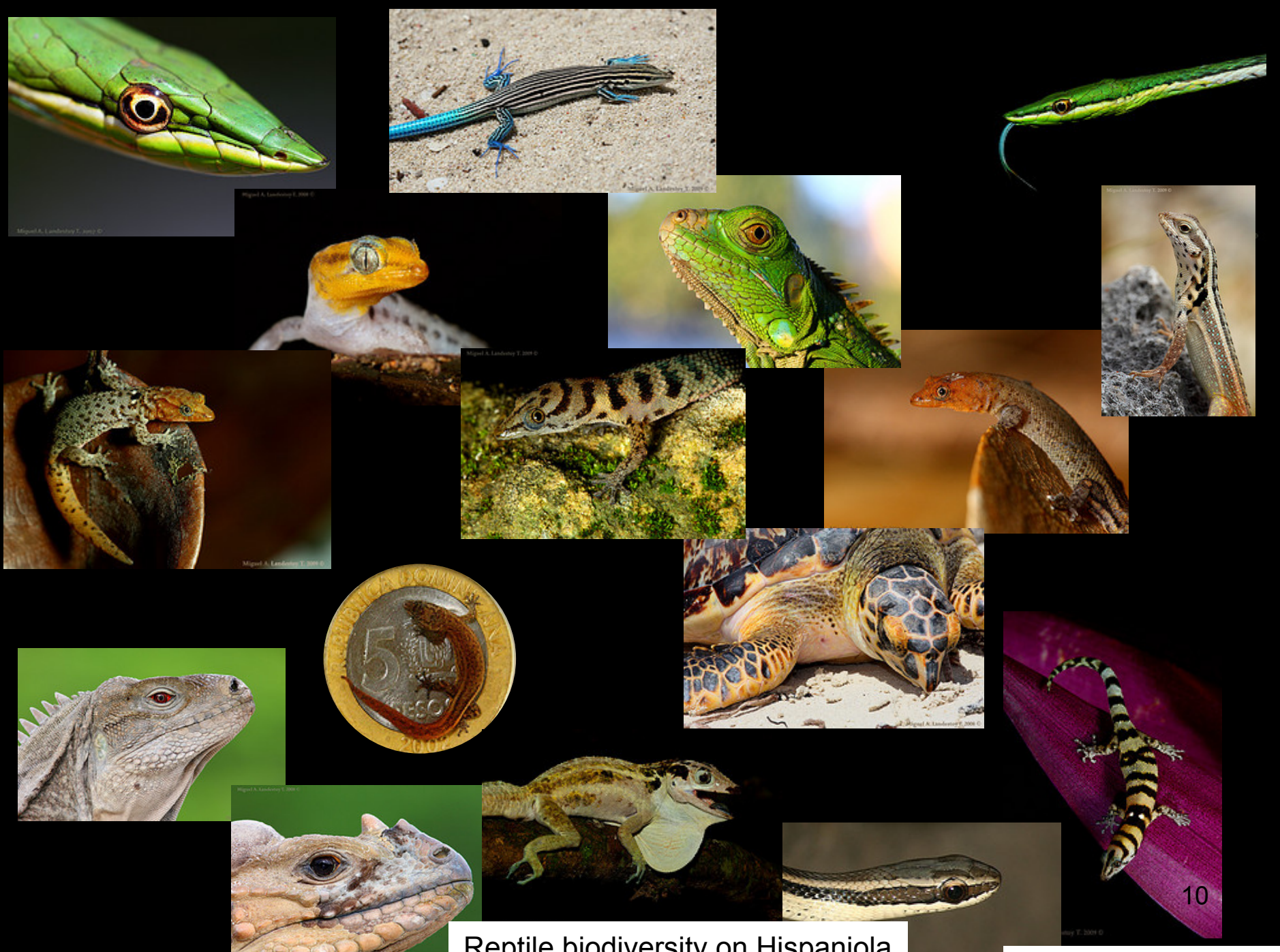
Reptile biodiversity on Hispaniola