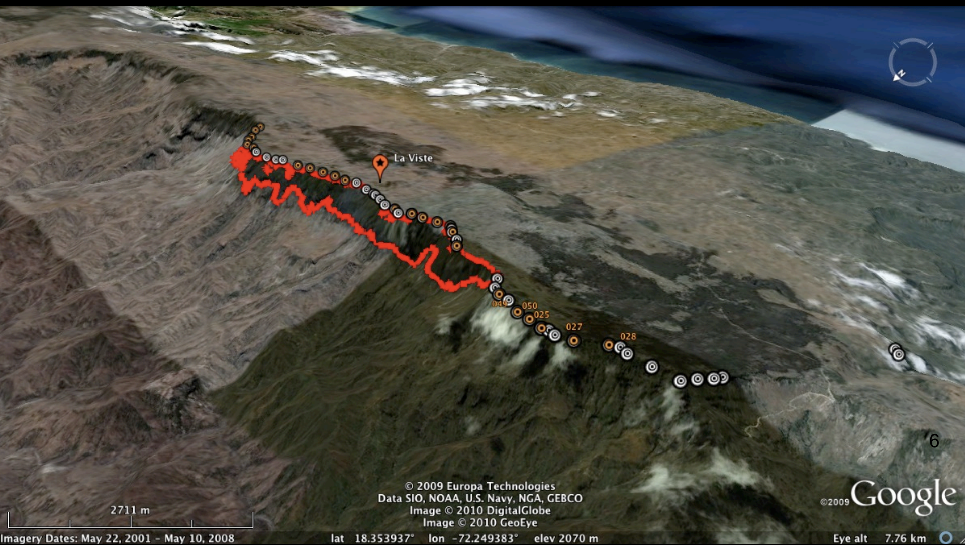
2008 La Visite survey points. Red polygon = remnant broadleaf forest & critical nesting habitat.