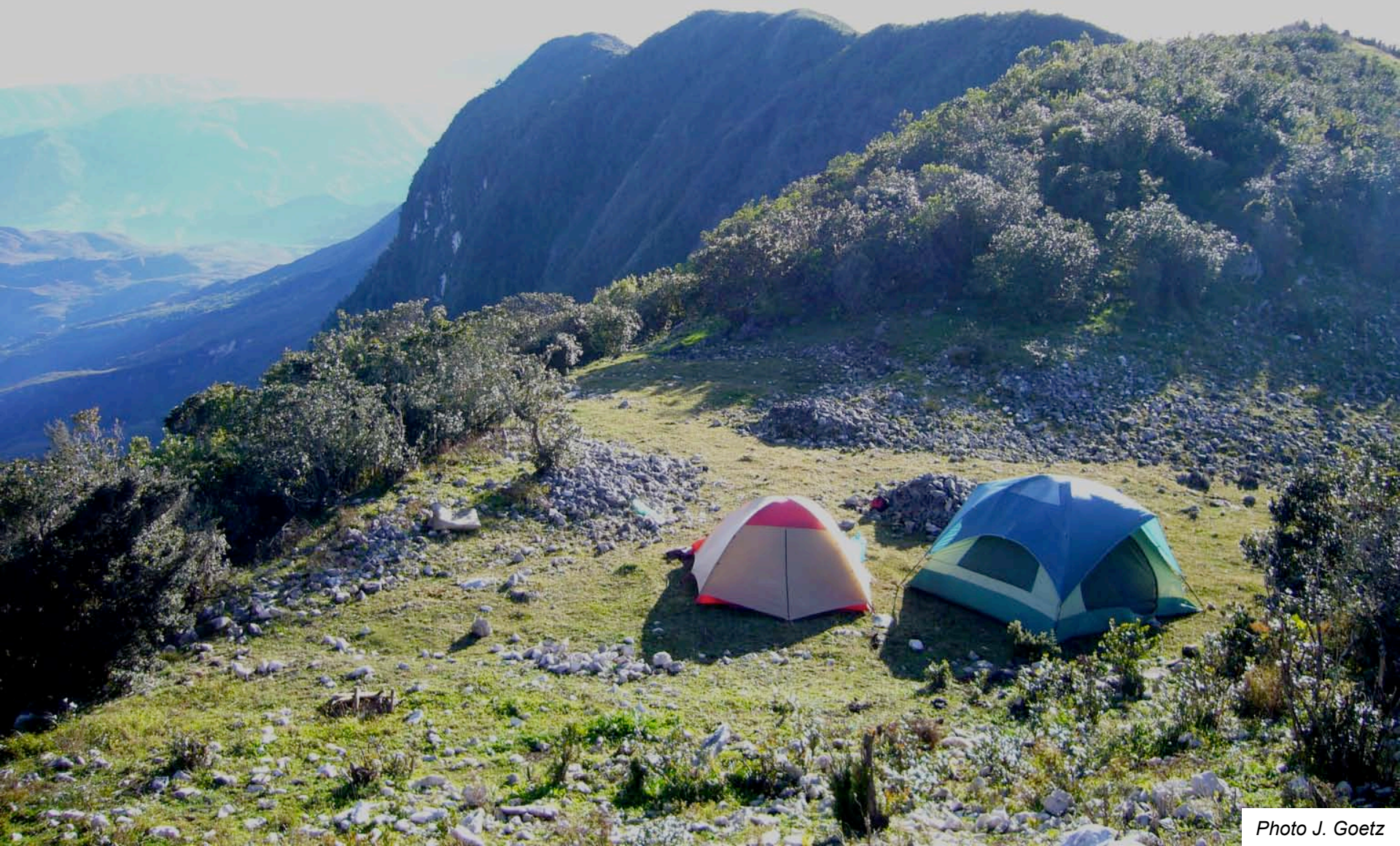
2008 La Visite Expedition. View to east from escarpment.