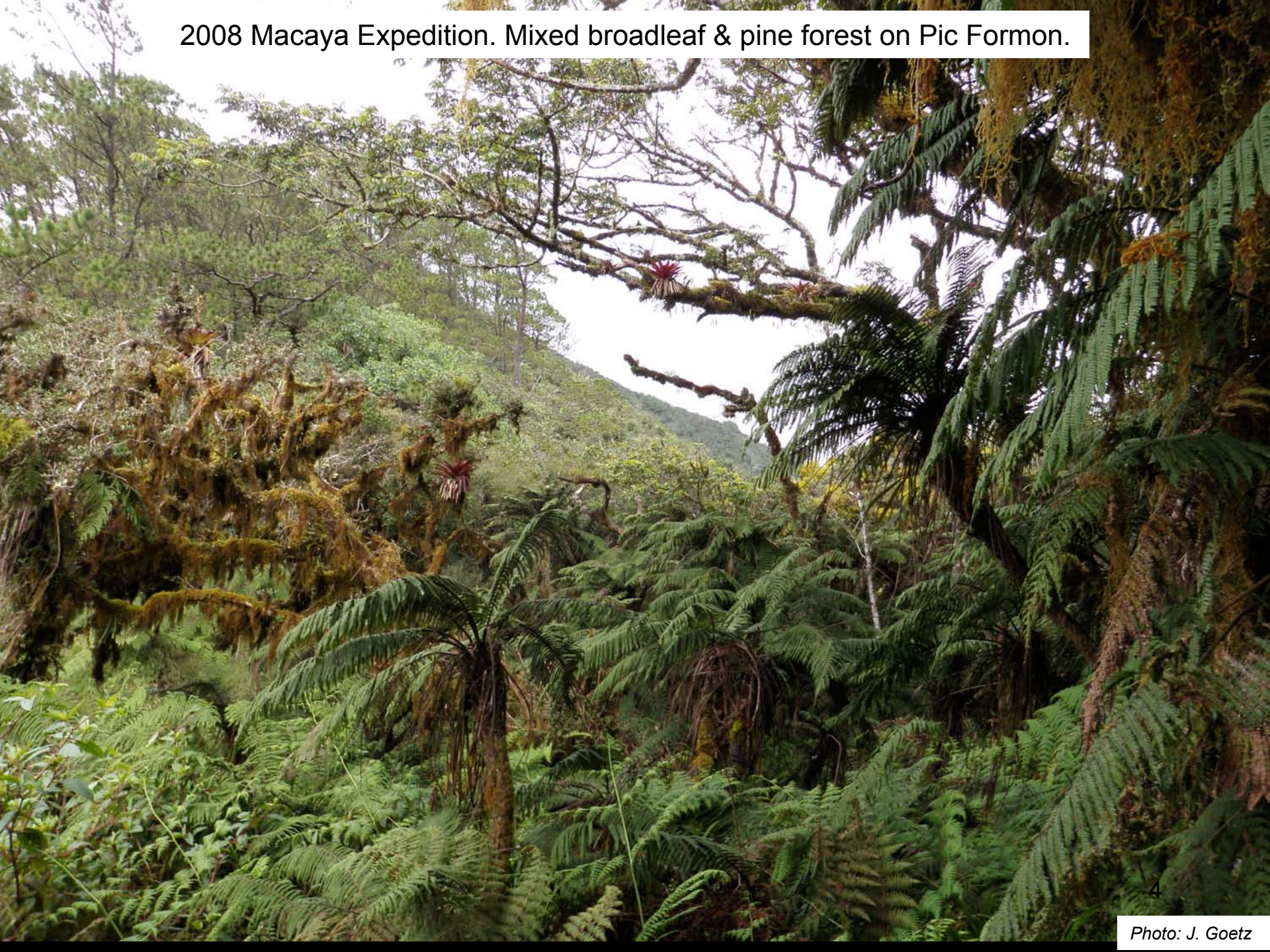
2008 Macaya Expedition. Mixed broadleaf & pine forest on Pic Formon.