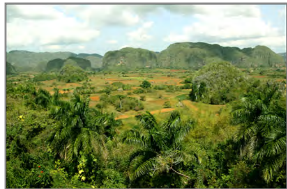
Viñales Valley with mogotes by Carrol Henderson

Day 4 (Zapata: La Cuchilla, Caminos los Jarros, Bermejas, Cueva de los Peces, and Los Hondones): Early breakfast and departure for Bermejas (45 minutes) for birding in mixed forest habitat (flat, easy-walking trail system 2+ miles). Excellent chance for Bee Hummingbird, Grey-fronted Quail-Dove, Key West Quail-Dove, Ruddy Quail-Dove, Cuban Parrot, Cuban Blackbird, Cuban Bullfinch, Loggerhead Kingbird, Bare-legged Owl and Cuban Pygmy Owl . The threatened Cuban Parakeet, Fernandina's Flicker , and Blue-headed Quail-Dove are also likely.