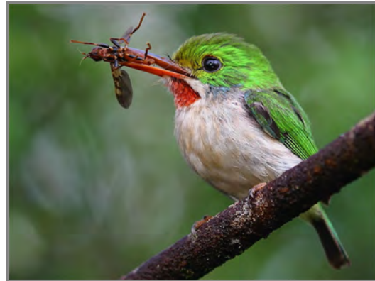
Cuban Tody by Ernesto Reyes

Cuba is well-known for its amazing landscapes, vibrant culture and unique biodiversity. According to the new Endemic Birds of Cuba: A Comprehensive Field Guide , over 371 birds have been recorded in Cuba, including 26 which are endemic to the island and 30 which are considered globally threatened. Due to its large land area and geographical position within the Caribbean, Cuba is also extraordinarily important for Neotropical migratory birds—more than 180 species pass through during migration or spend the winter on the island.