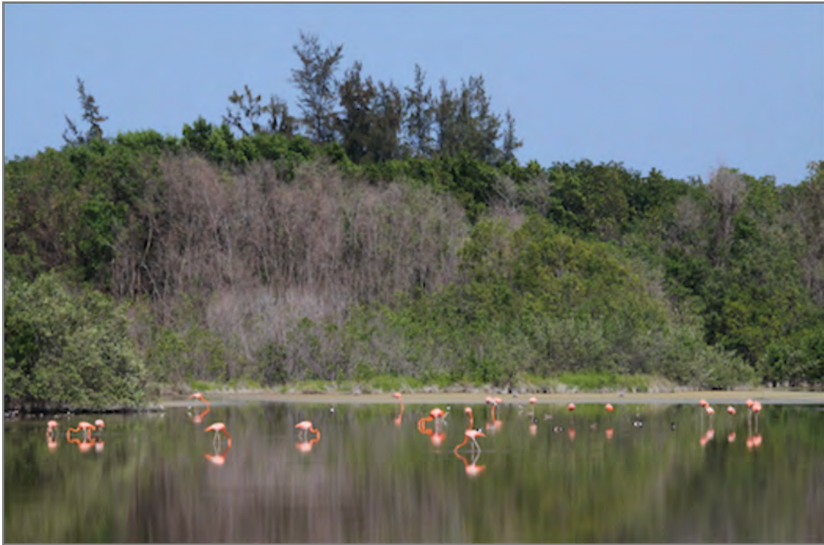
Flamingo Lagoon at Cayo Coco by Carrol Henderson