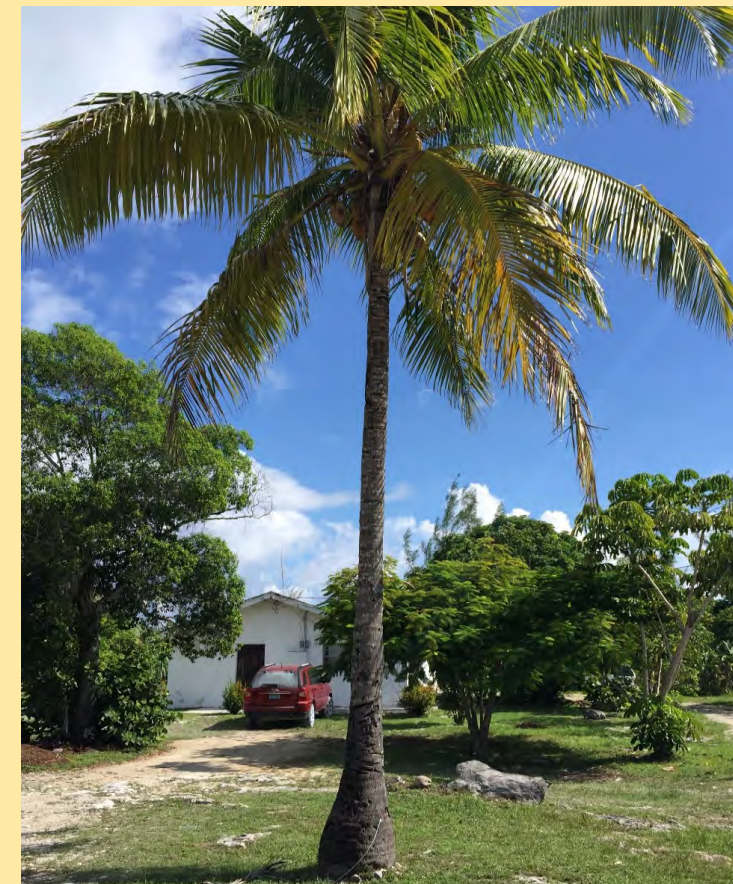
Developed Areas w Coconut Palms* (orioles detected 12% points)