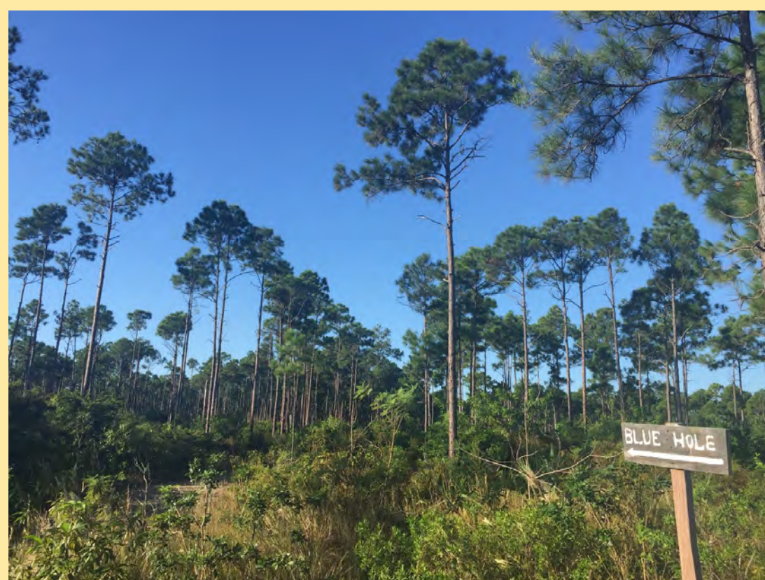
Pine Forest (orioles detected 11% points)