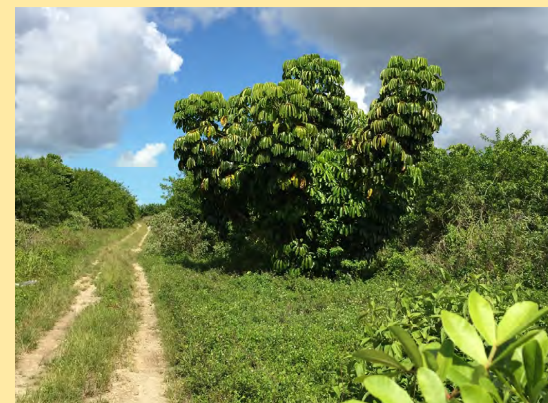
Second Growth / Agriculture* (orioles detected 6% points)