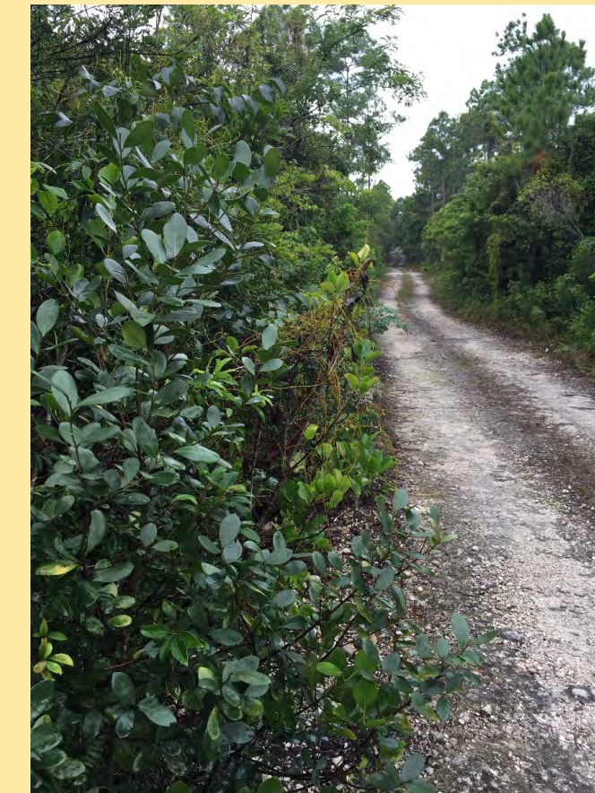
Mixed Pine/Coppice (orioles detected 38% points)