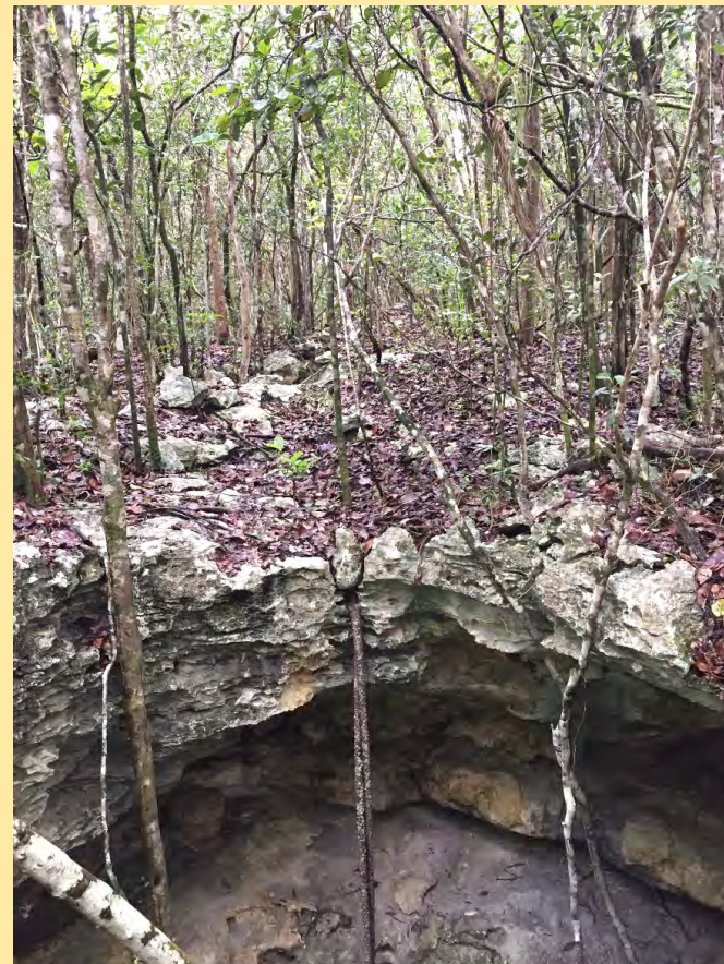
Coppice (Hardwood) Forest (orioles detected 13% points)