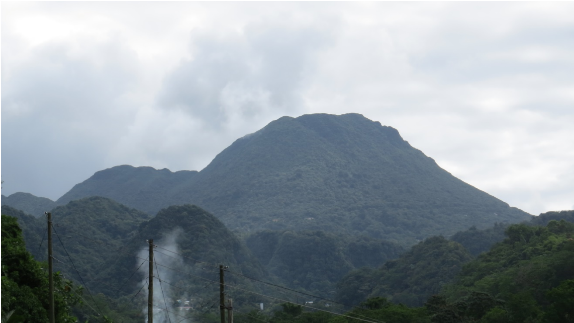
Day 1 – view of western flanks of Morne Micotrin from Roseau valley road