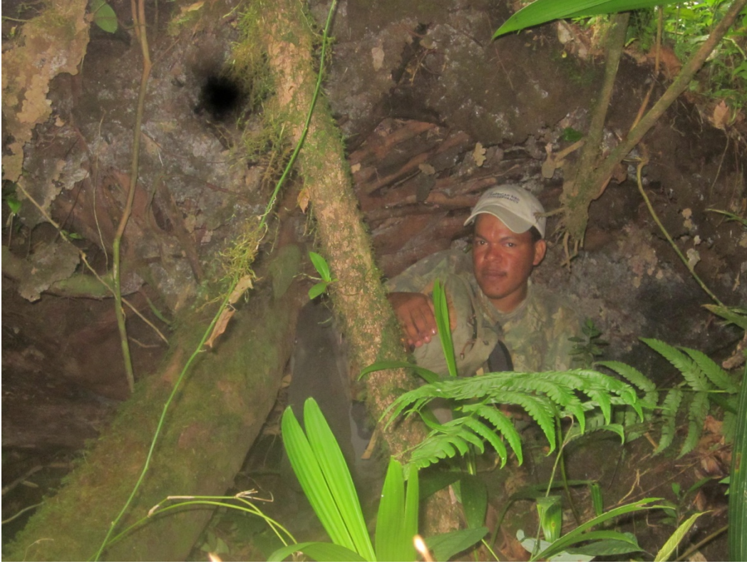
Small cave on Morne Micotrin