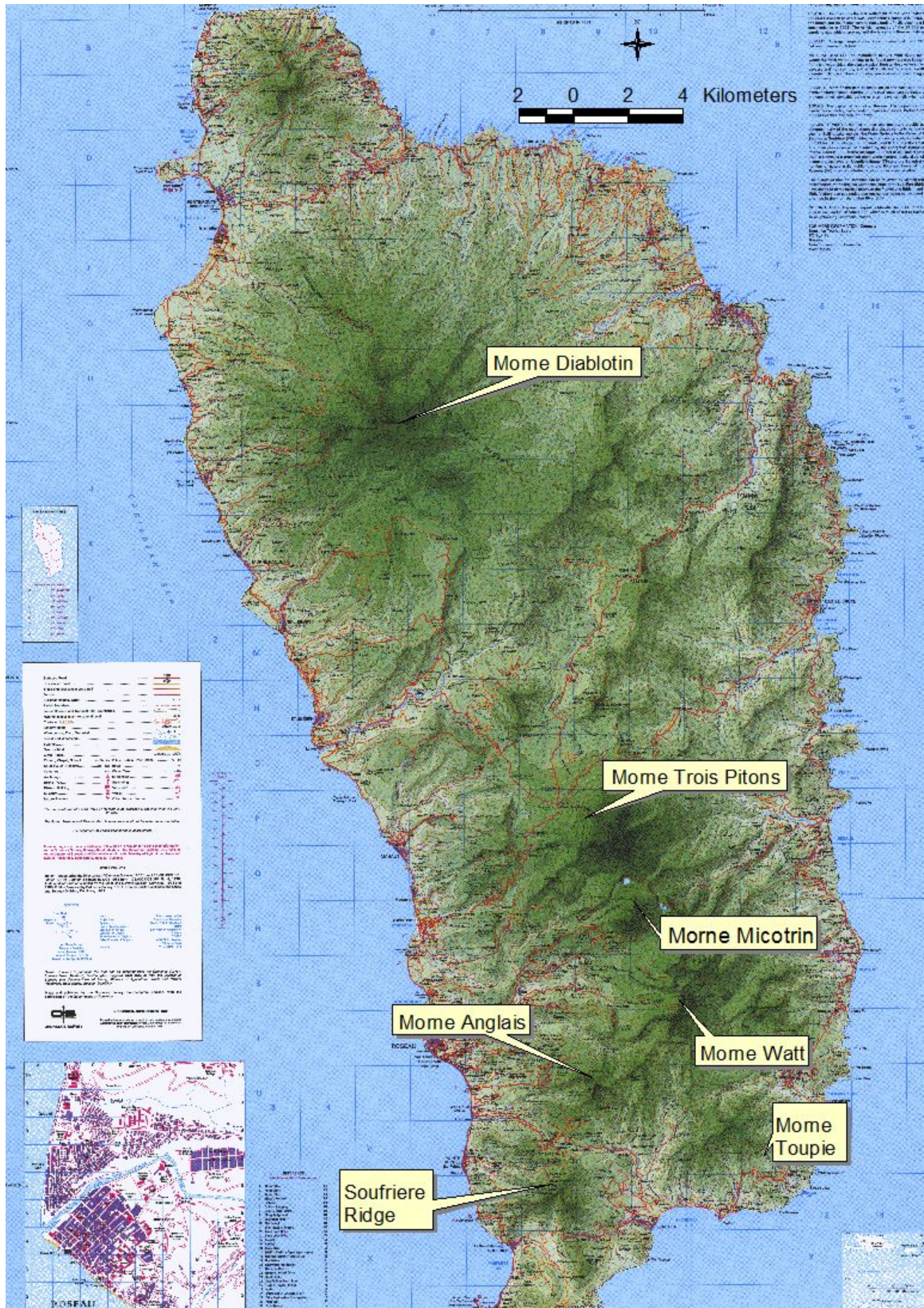
Map 1: General view of Dominica with possible relevant areas for BCPE nesting