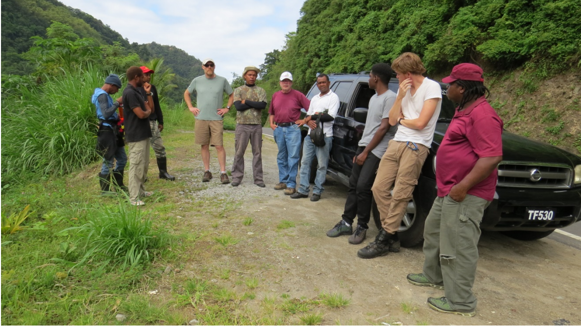
Day 1- planning ahead of reconnaissance trips at Cophall, Roseau valley