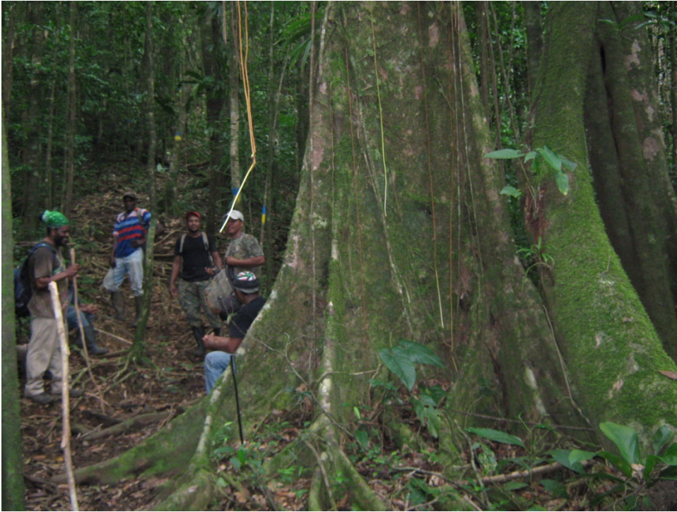
Mature Rain Forest