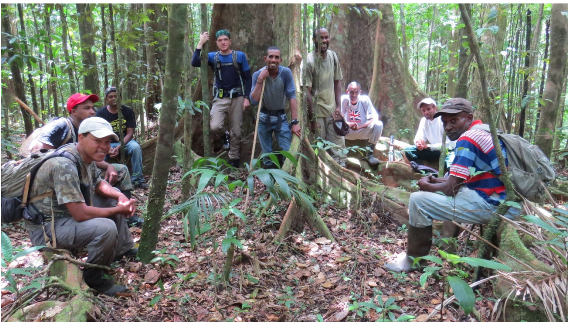
BCPE nest search Team Rainforest – foothills of Morne Trois Pitons