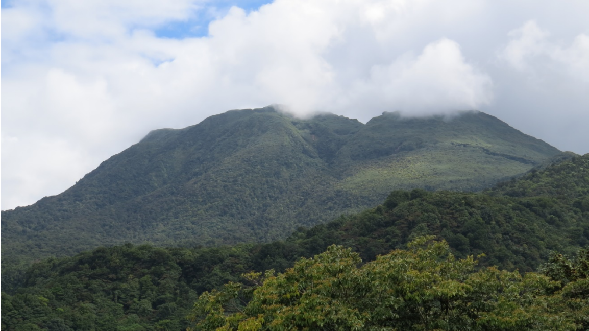
Day 1 – view of south and southwestern sides of Morne Trois Pitons