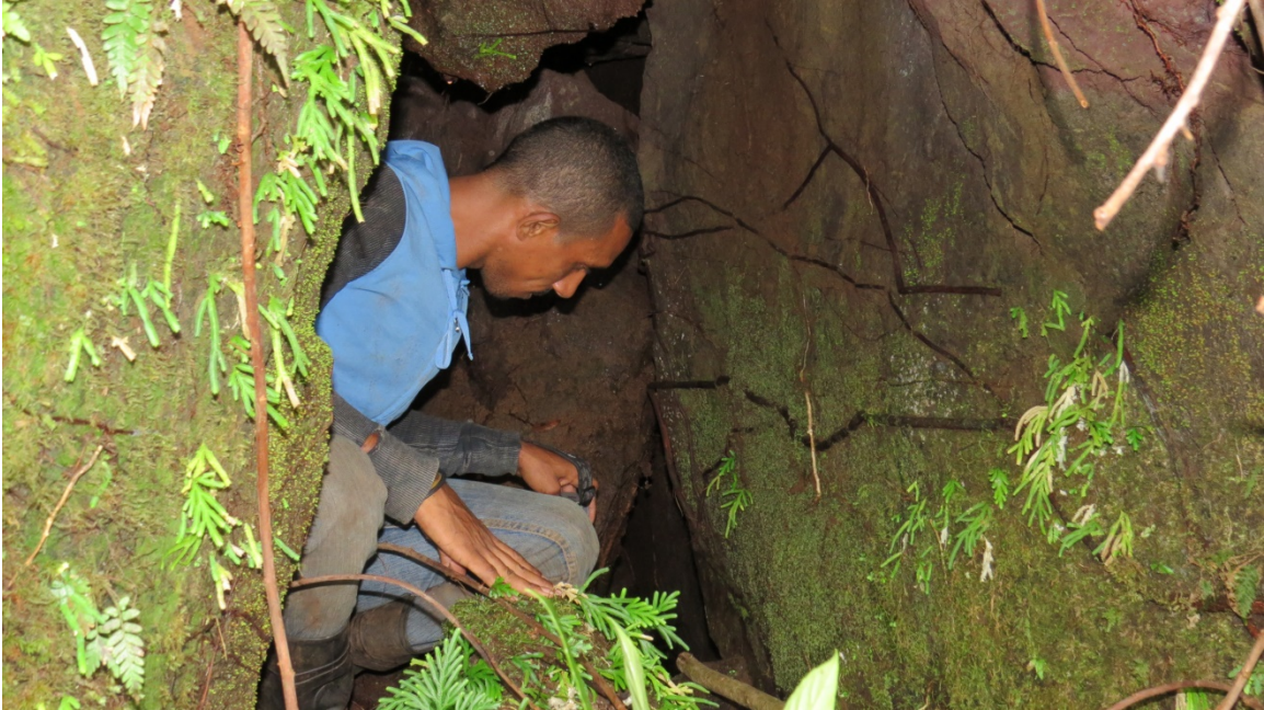
Searching a potential site with lots of caves on the northwestern side of Morne Micotrin cave within volcanic rock