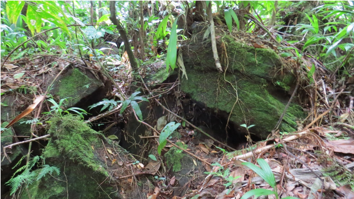
Forest floor with rocks and crevices – northwestern Micotrin