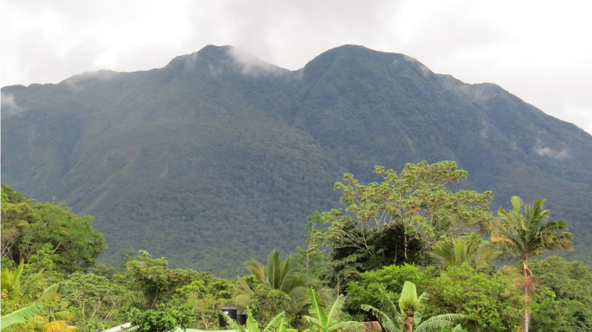
Day 1- view of western side of Morne Trois Pitons from Sultan road