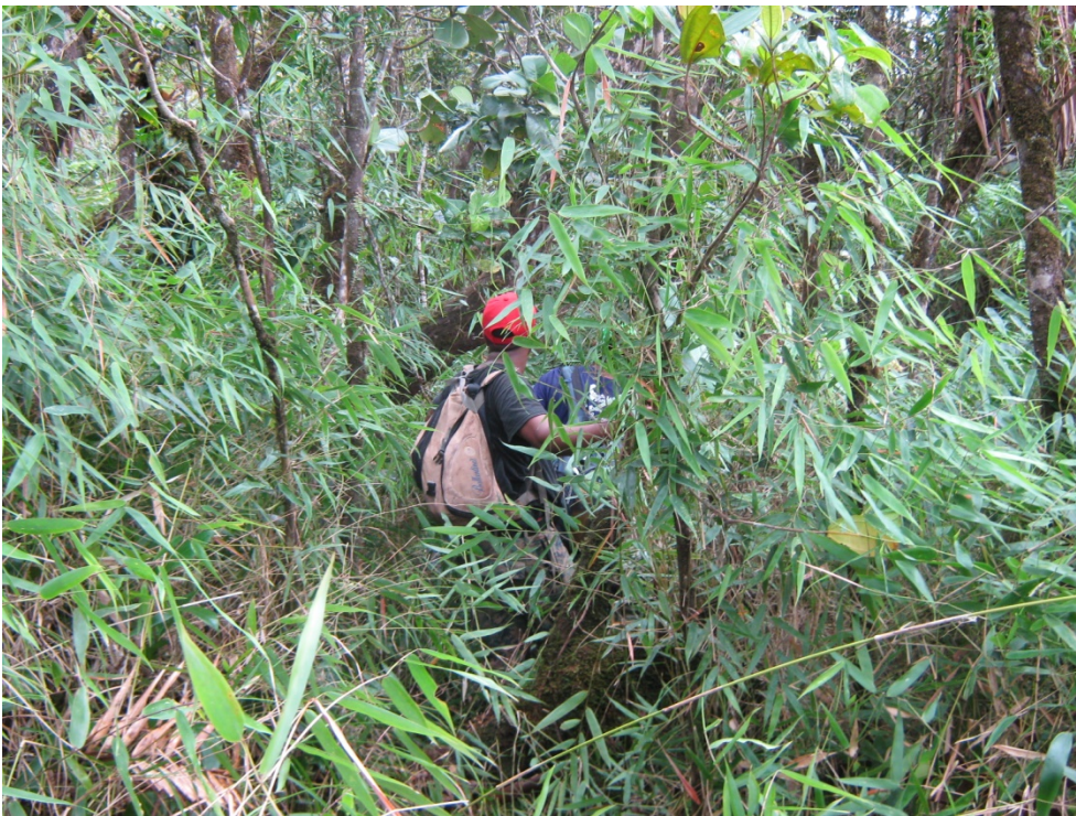
Bamboo thicket on Morne Trois Pitons