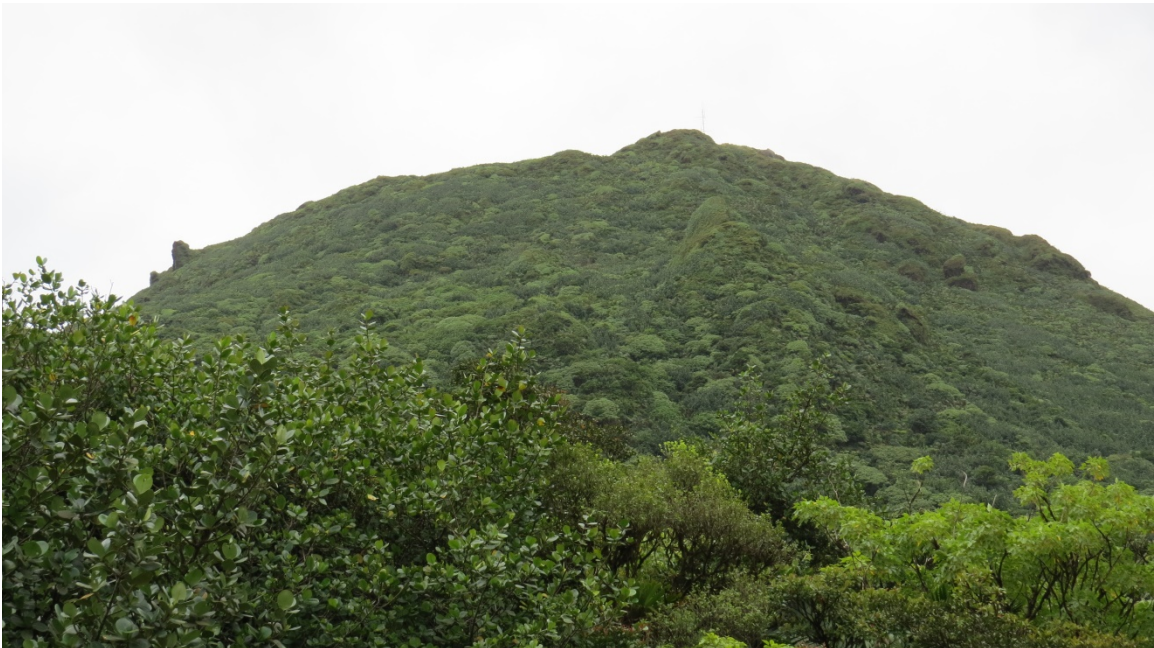
Day 1 - view of Northern side of Morne Micotrin from Boeri Lake road