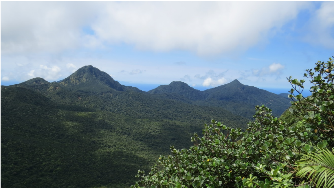
View of Morne Watt, Morne John and Morne Anglais from Micotrin