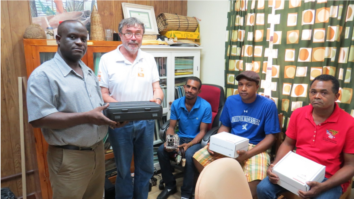
BCPE research & monitoring equipment delivered on behalf of ABC to Director of Forestry