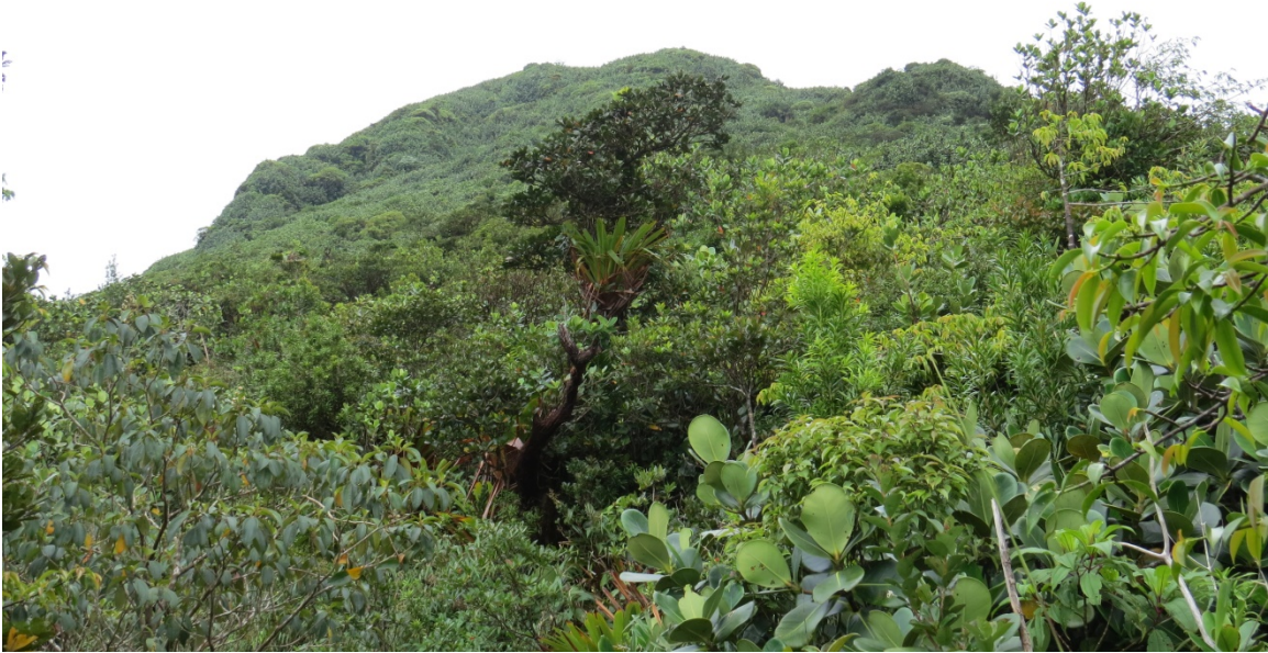
Summit – western flank of Morne Trois Pitons