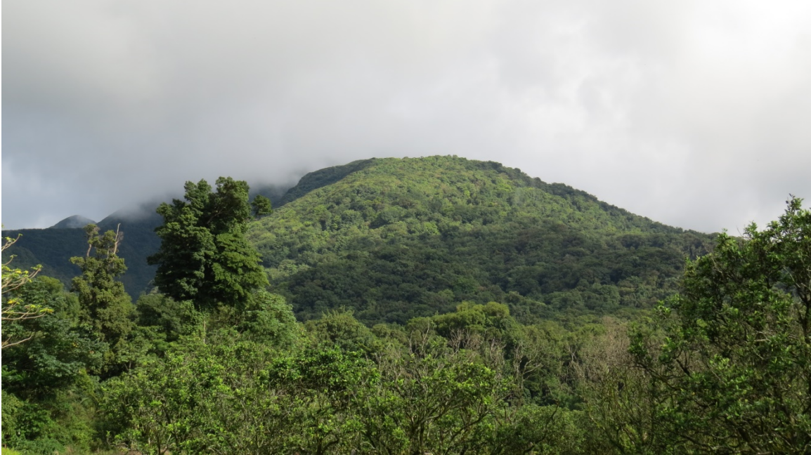
Day 1 - Northwestern flank of Morne Diablotin