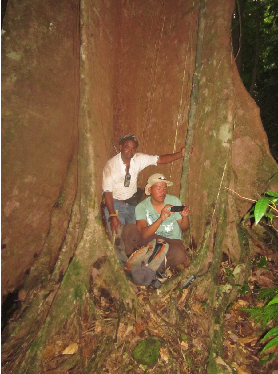
Buttressed tree in mature rainforest