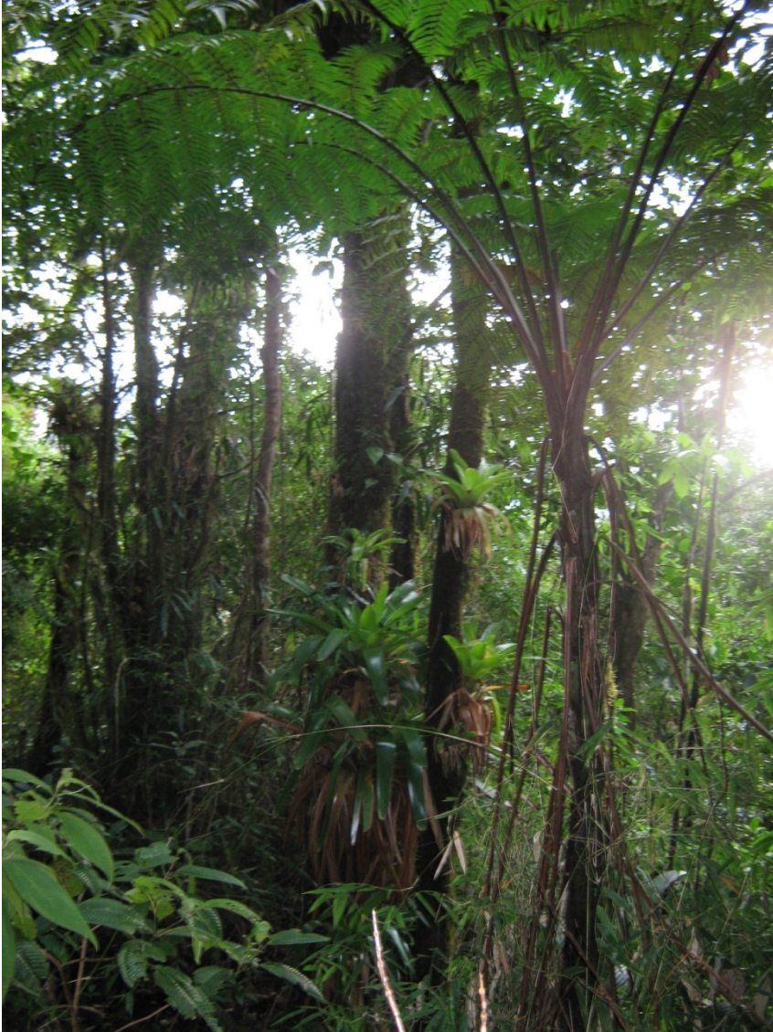
Montane Rain Forest with tree ferns