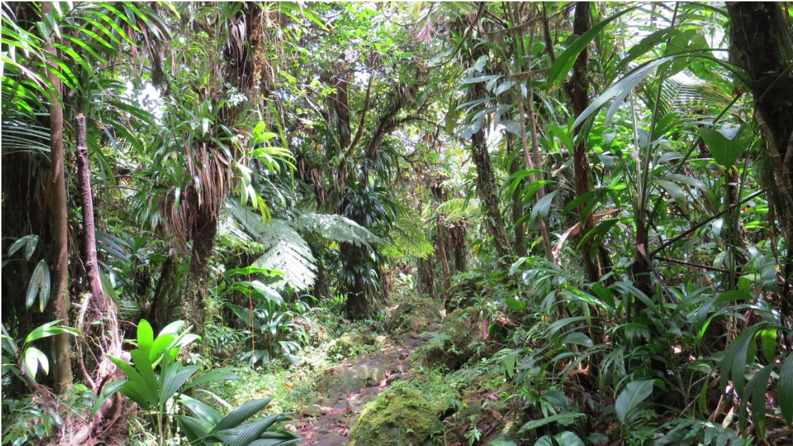
Upper Montane forest – Boeri Lake trail