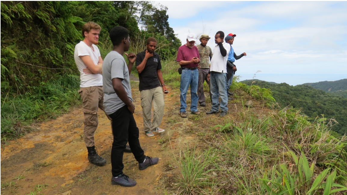
Day 1 - Team planning and discussions continued near Laudat village ahead of reconnaissance of Morne Micotrin