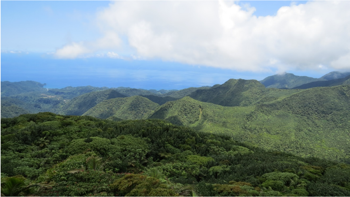
View of the Atlantic coast from Morne Micotrin