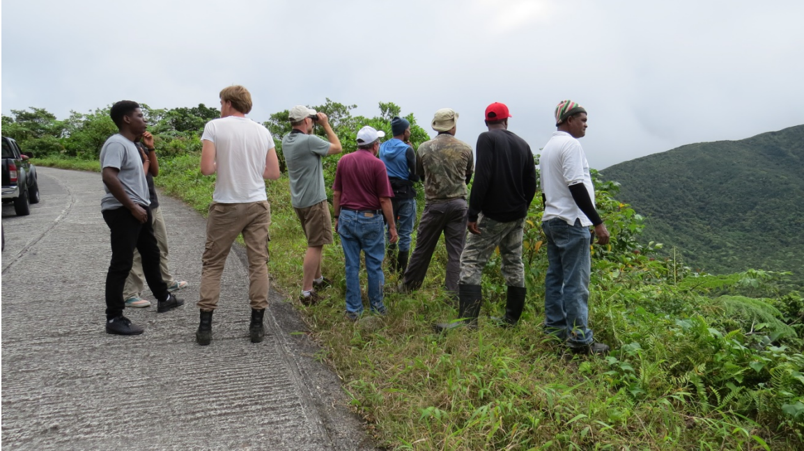
Day 1- Strategizing on selection of sites to conduct nest search - Freshwater Lake road