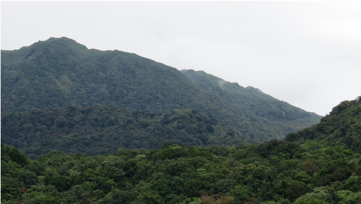
Day 1- southwestern side of Morne Trois Pitons from the Imperial road