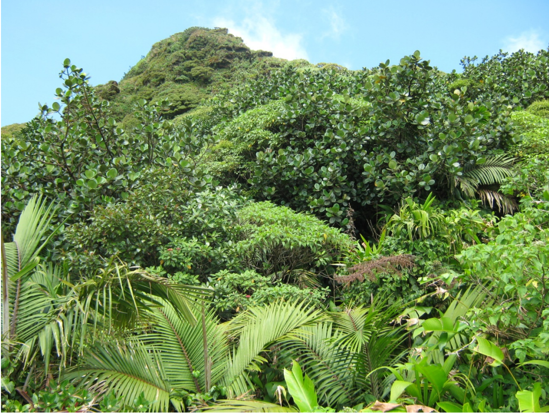
Peak of Morne Micotrin with elfin woodland