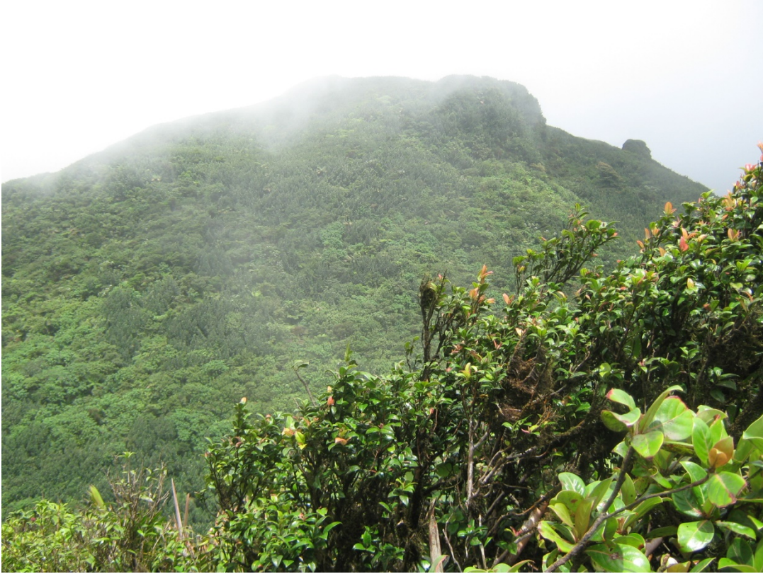
Pristine northwestern flank of Morne Micotrin in mist