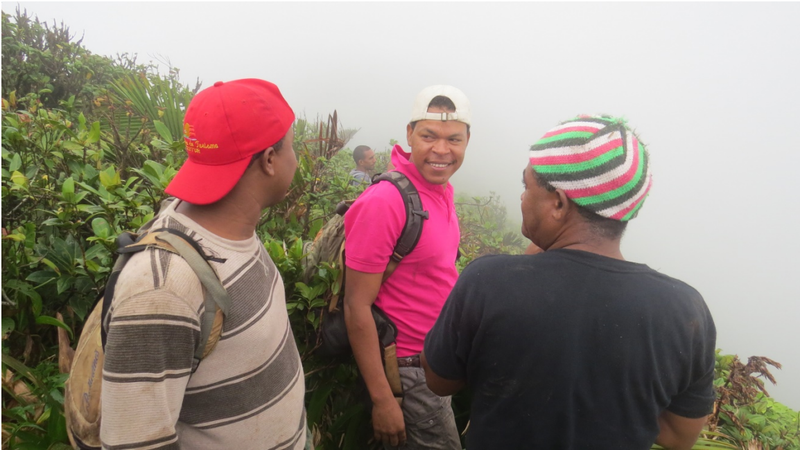
Final day in the misty Cloud Forest between Micotrin and Morne Trois Pitons