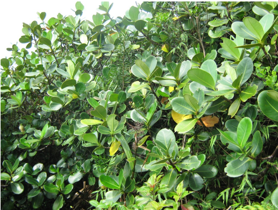
Clusia mangle , a major component of the elfin woodland