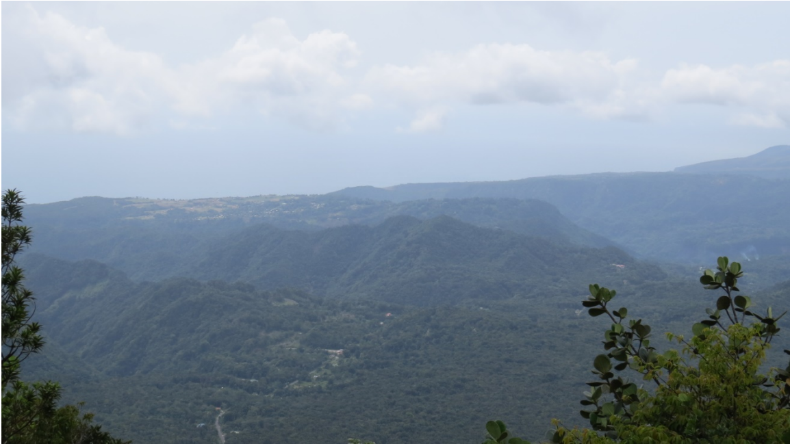
View of Leeward coast from Morne Trois Pitons