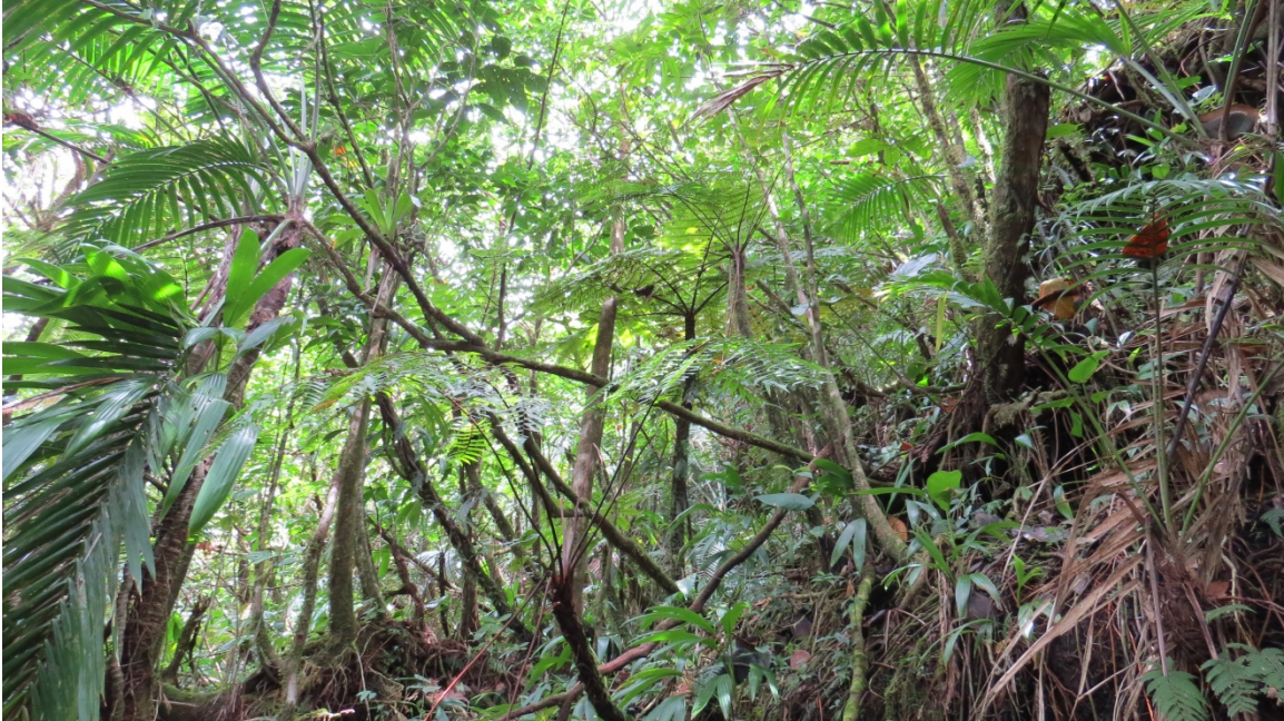
Upper Montane forest – Micotrin